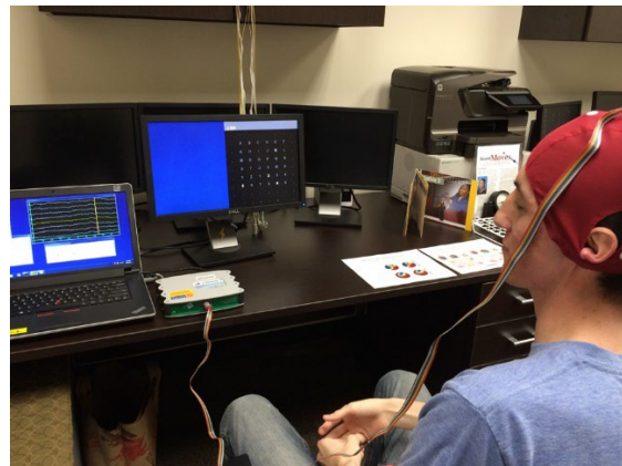
Figure 1. A Student Spells His Name Using a Neural Speller

As another example, Figure 1 shows the result of a student's participation in a technology demonstration where he was able to spell his name completely hands-free using just his thoughts and a P300-Speller (Donchin et al., 2000). Such experiences allowed students to better grasp the concepts being taught.