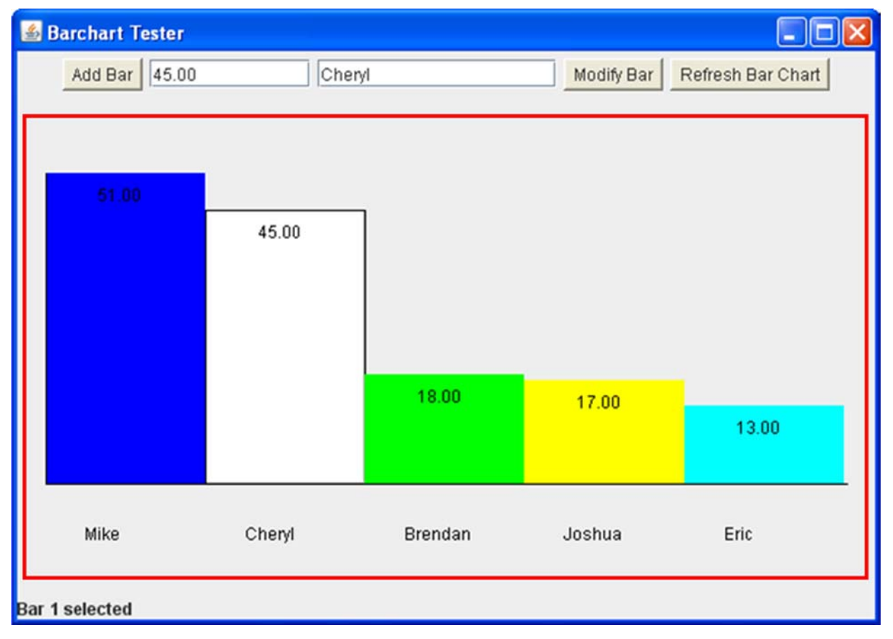
Figure 1: A BarChartPanel used by a tester application.

The bar chart JavaBean component discussed in this paper is a graphical component that can be embedded in Java applications, either through instantiation in the code, or by dragging onto a form in an IDE's form builder. The BarChartPanel class is a subclass of JPanel, so this is a GUI component that can be placed into another Java Swing container, such as a frame, an applet, or another panel. The component requires two arrays for input data: an array of